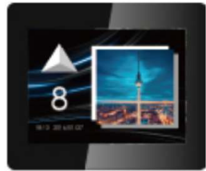
LCD display (LCD1)