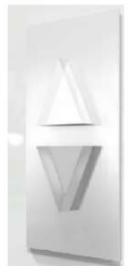
Arrival indicator (AI1)