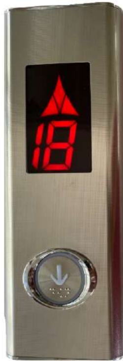
Landing panel ( LP1 Wall mounted)