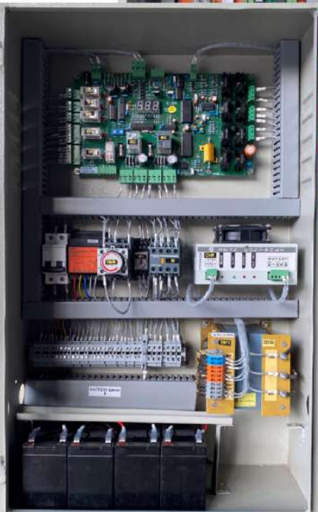
ARD (Auto Rescue Device)