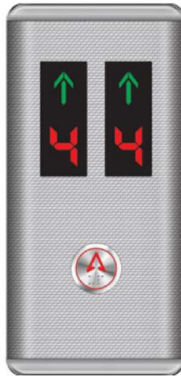
Duplex Landing panel (LP2)