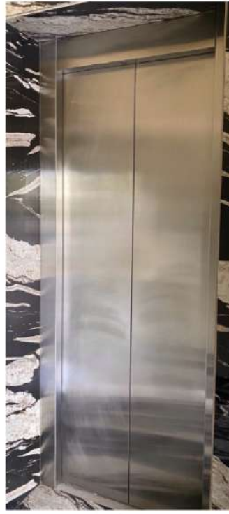
Standard Door (S S Hairline)