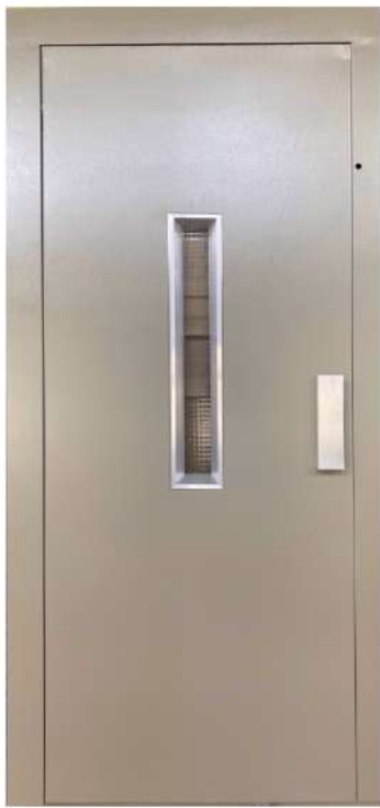
M S Swing 1 (D1)