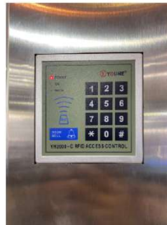
Access control (AC1)