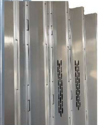
S S Imperforated (D4)