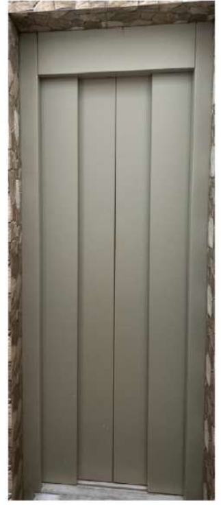
4 panel Door (M S Powder Coated)