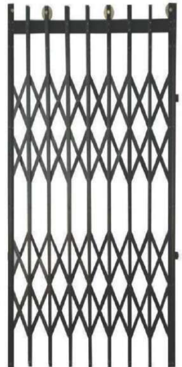
M S Collapsible (D5)