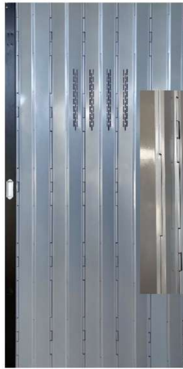
M S Imperforated (D3)