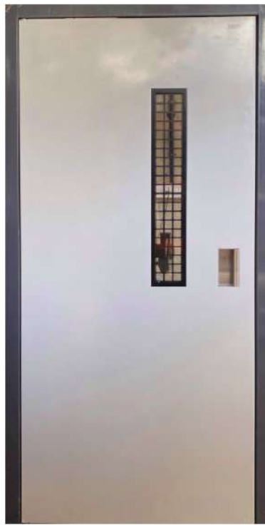
M S Swing 2 (D2)