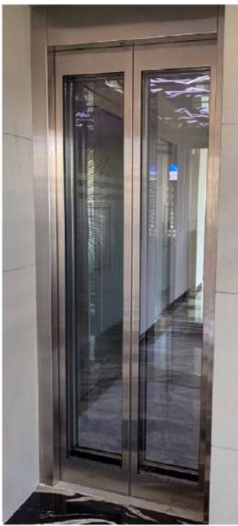
Big vision Door (S S Hairline)