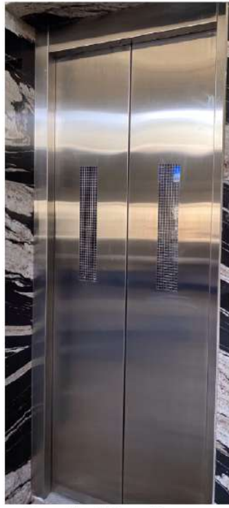
Small vision Door (S S Hairline)