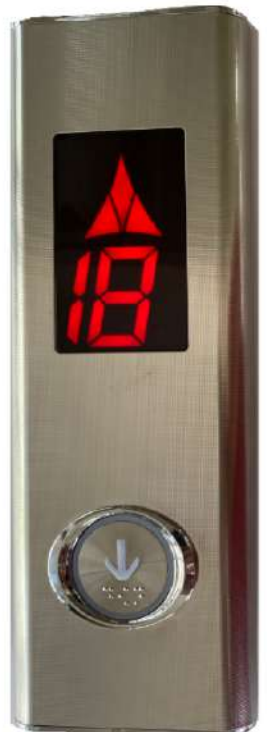
Landing panel (Wall mounted LP1)